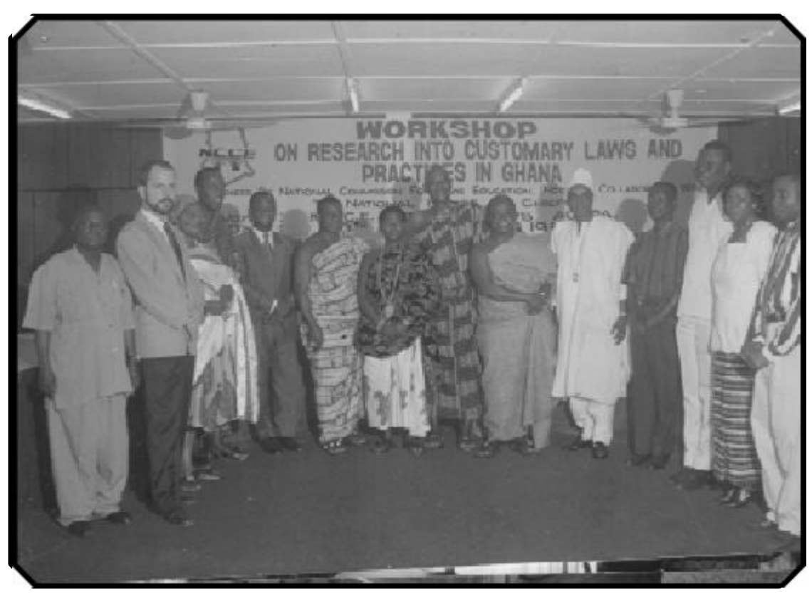
August 21, 1998: A group picture of participants in a workshop on Research into Customary Law and Practices in Ghana.