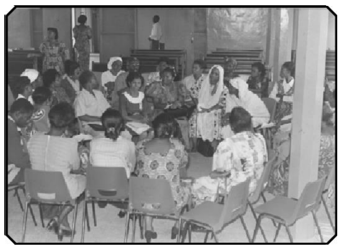
A syndicate group discussion of participants at the seminar organized by the NCCE for women's groups on the theme 'Women Participation in Decision Making' at the Social Centre of St. Peter's Cathedral, Kuamsi.